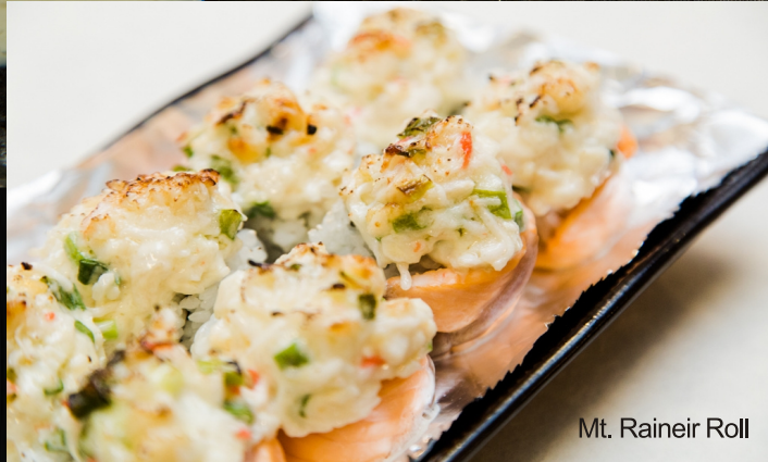
Mt. Rainier Roll