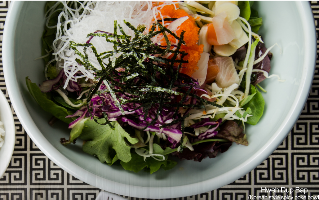
Hweh Dup Bap (Korean style spicy poke bowl)