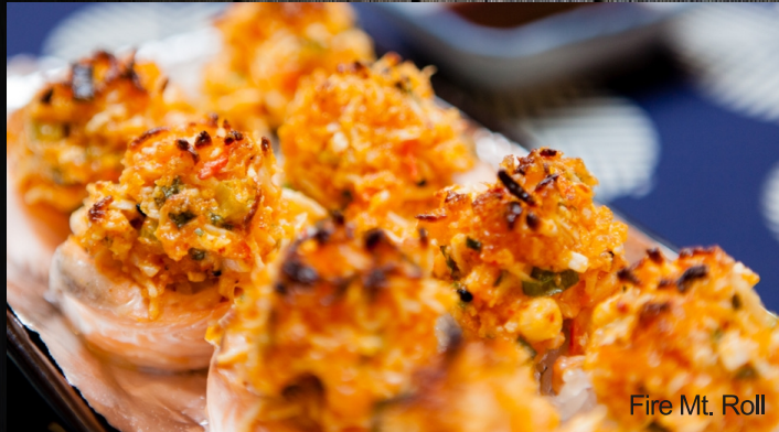
Fire Mt. Roll